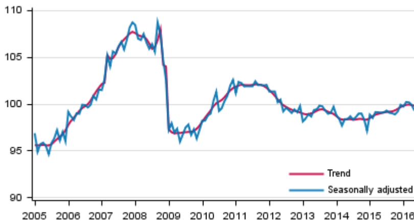
Volume of total output 2005 to 2016, trend and seasonally adjusted series

The series of the Trend Indicator of Output are seasonally adjusted with the Tramo/Seats method. The latest observations of the series adjusted for seasonal and random variation (seasonally adjusted and trend series) become revised with new observations in seasonal adjustment methods. Revisions especially at turning points of economic trends may be significant, which should be taken into consideration when using seasonally adjusted and trend data.