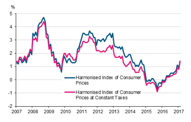
Appendix figure 4. Harmonised Index of Consumer Price Index 2015=100; Finland, euro area and EU

Appendix figure 3. Annual change in the Harmonised Index of Consumer Prices and the Harmonised Index of Consumer Prices at Constant Taxes, January 2007 - February 2017