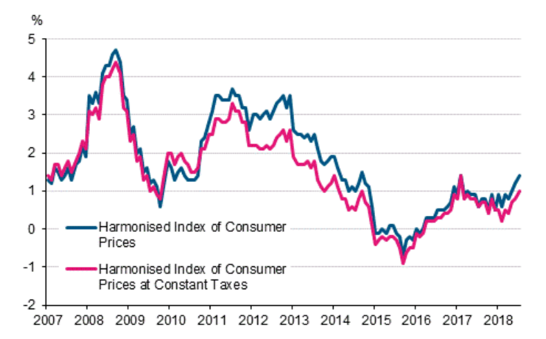
Appendix figure 4. Harmonised Index of Consumer Price Index 2015=100; Finland, euro area and EU

Appendix figure 3. Annual change in the Harmonised Index of Consumer Prices and the Harmonised Index of Consumer Prices at Constant Taxes, January 2007 - July 2018