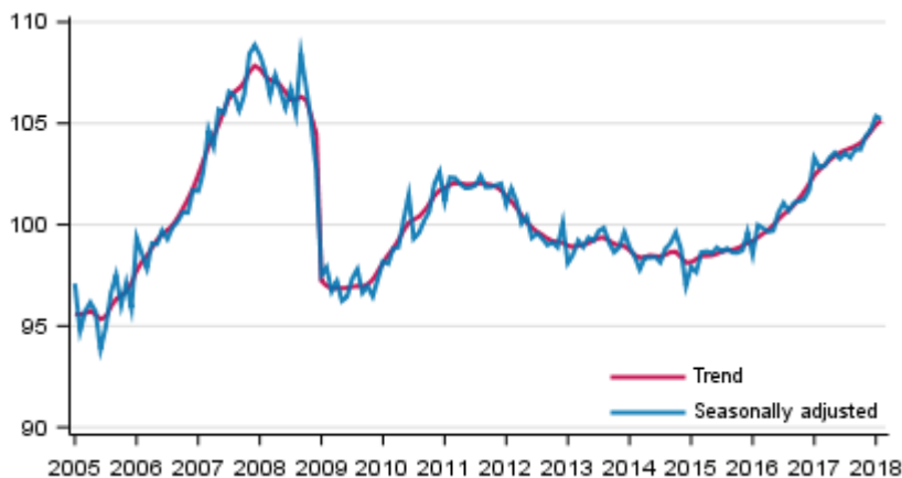
Volume of total output 2005 to 2018, trend and seasonally adjusted series

The series of the Trend Indicator of Output are seasonally adjusted with the Tramo/Seats method. The latest observations of the series adjusted for seasonal and random variation (seasonally adjusted and trend series) become revised with new observations in seasonal adjustment methods. Revisions especially at turning points of economic trends may be significant, which should be taken into consideration when using seasonally adjusted and trend data.